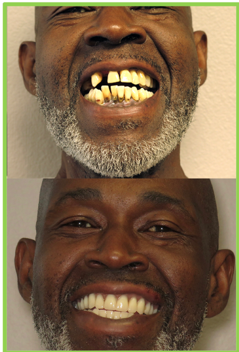
Referred by Christian Service Center

Before the WODA program, my confidence level wasn't very high, my self-esteem level as well. I'm one of those people that like smiling and with the bad teeth I was not able to do that anymore. Now I can smile again. Thanks to everyone involved in this smile and life changing program.