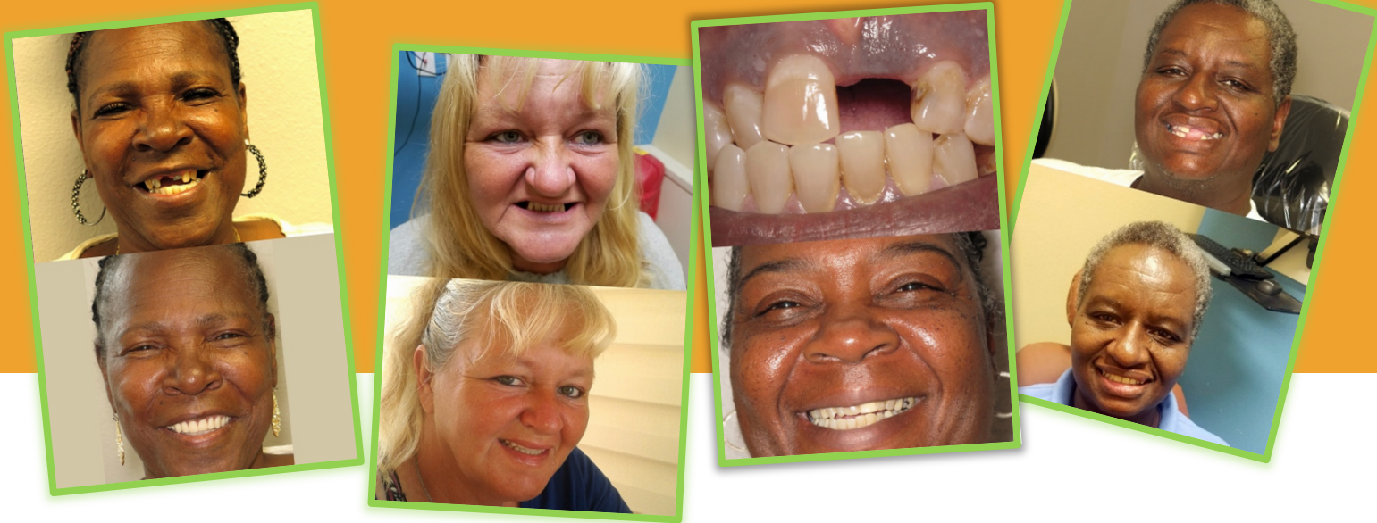
From left to right, Referred By: Maxey Community Center; Shepherds Hope; Circles Orange County; Christian Service Center.