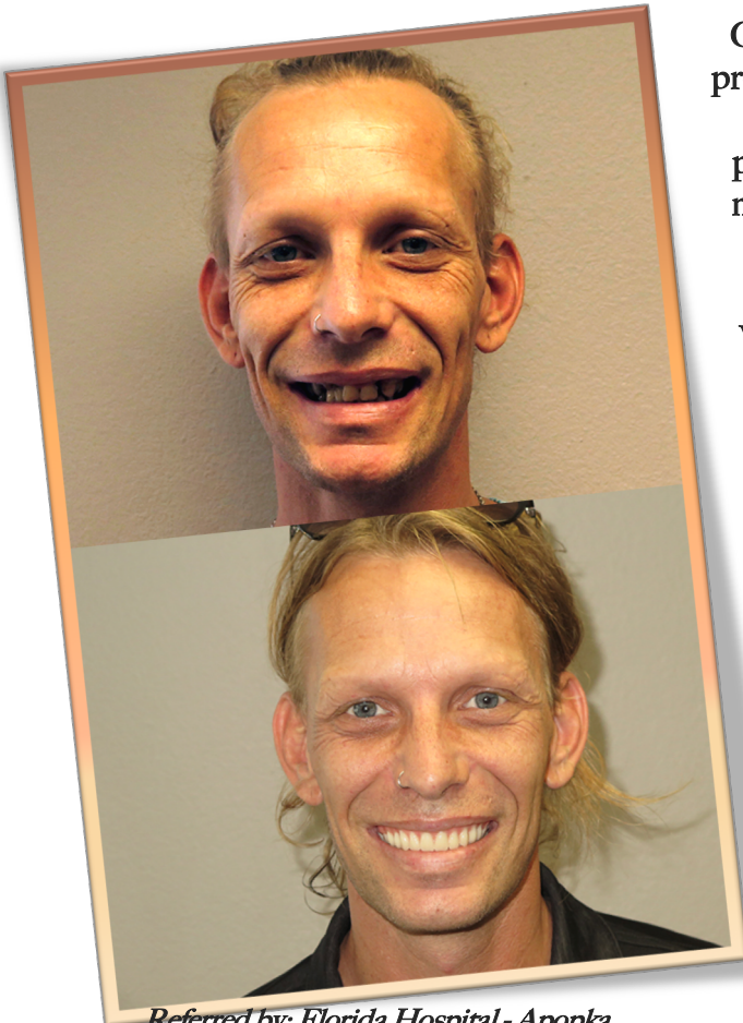
Referred by: Florida Hospital - Apopka

Getting accepted in this program really changed my life, in the long run it probably saved it. I could not ask for a better staff of lady's who care not even knowing who you are or where you come from. No matter if you were feeling down about the procedure or whatever the issue may be, they always had a way to cheer u up and make u feel safe and comfortable. Since I've received my new beautiful smile I've started a new job as a