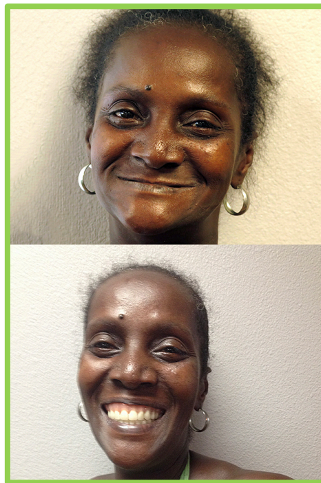
Referred by Maxey Community Center